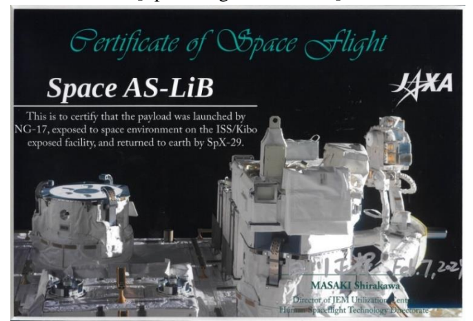
[Space Flight Certificate]