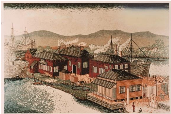
Osaka Ironworks at the time of its foundation (illustration)

The change of trade name to Kanadevia enables us to build a new history as a corporate group that applies the power of technology to create a world that lives in harmony with nature.