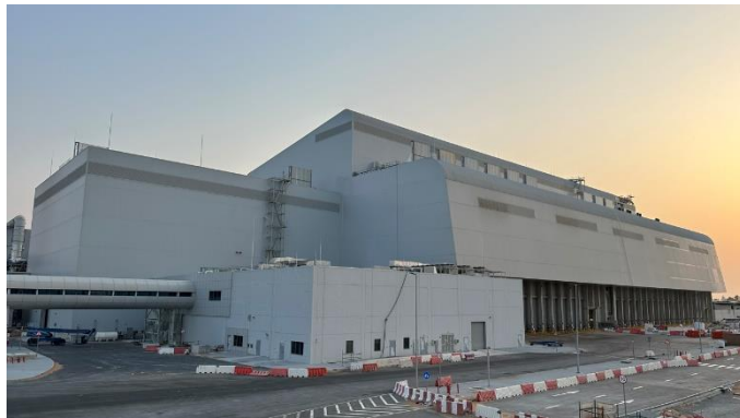
Waste-to-Energy plant, our main business (One of the world's largest facilities under construction in Dubai)