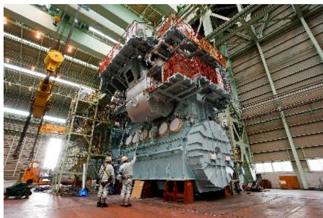
Marine diesel engine business started cooperation with Imabari Shipbuilding Co. in April 2023.

The Hitachi Zosen Group has repeatedly changed with each era and has overcome various rough seas. After separating the shipbuilding business and moving on to land, Hitachi Zosen, as the new "Kanadevia," will continue to create value for society with technology and sincerity, and contribute to a prosperous future together with all of our stakeholders.