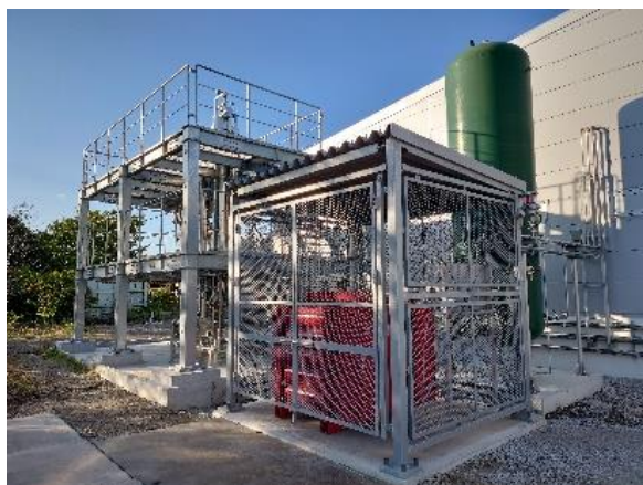
Methanation facility expected to contribute to carbon neutrality