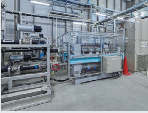
Hydrogen generation system for Hokkaido Electric Power Co.,

-0.3 billion yen Year on year comparison (up 0.2 billion yen)