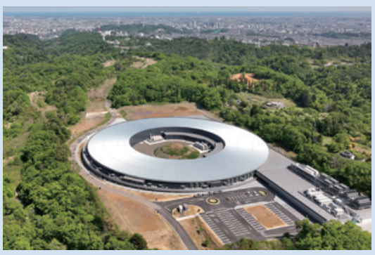
NanoTerasu

The facility is preparing to begin full-scale operations in 2024 as the foundation supporting science and technology in general. The Company delivered technologies that are essential to the facility, from access management systems to vacuum equipment, and while continuing to strive to increase the level of technological precision, we will contribute to creating a carbon-neutral society and solving social issues in the medical and other industries.