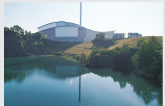
WtE plant for Leicestershire, UK

0.5 billion yen Year on year comparison (up 0.6 billion yen)