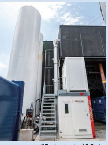
CO<sub>2</sub> liquefaction facility (Switzerland)

In addition, a 20-year biomethane supply project has been decided in Italy. The reduction and reuse of CO<sub>2</sub> through these projects will contribute to the promotion of decarbonization, and the Group will continue to contribute to the global environment by providing products and technologies related to clean energy.